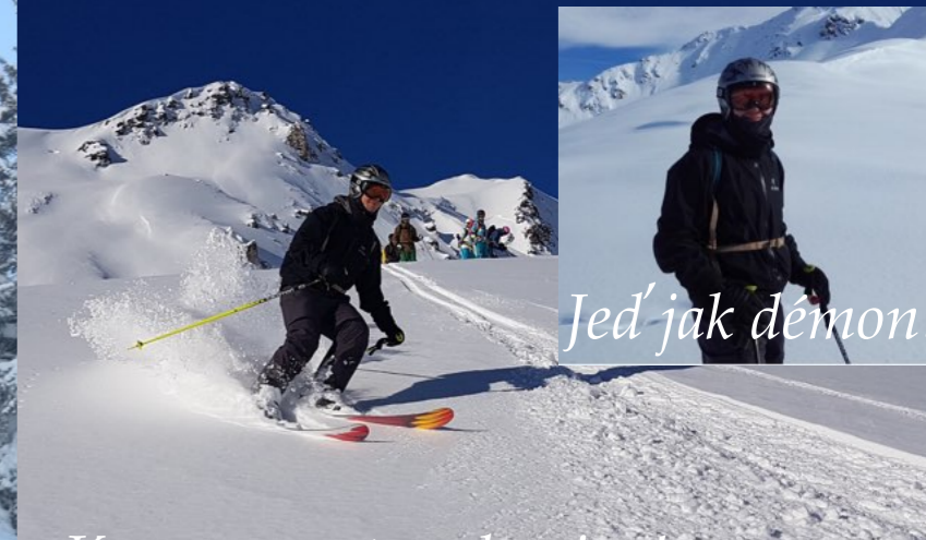
Jed' jak démon!