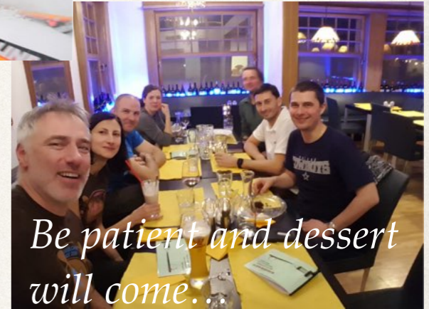
Be patient and dessert will come...