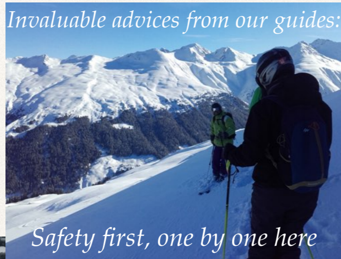
Invaluable advices from our guides: