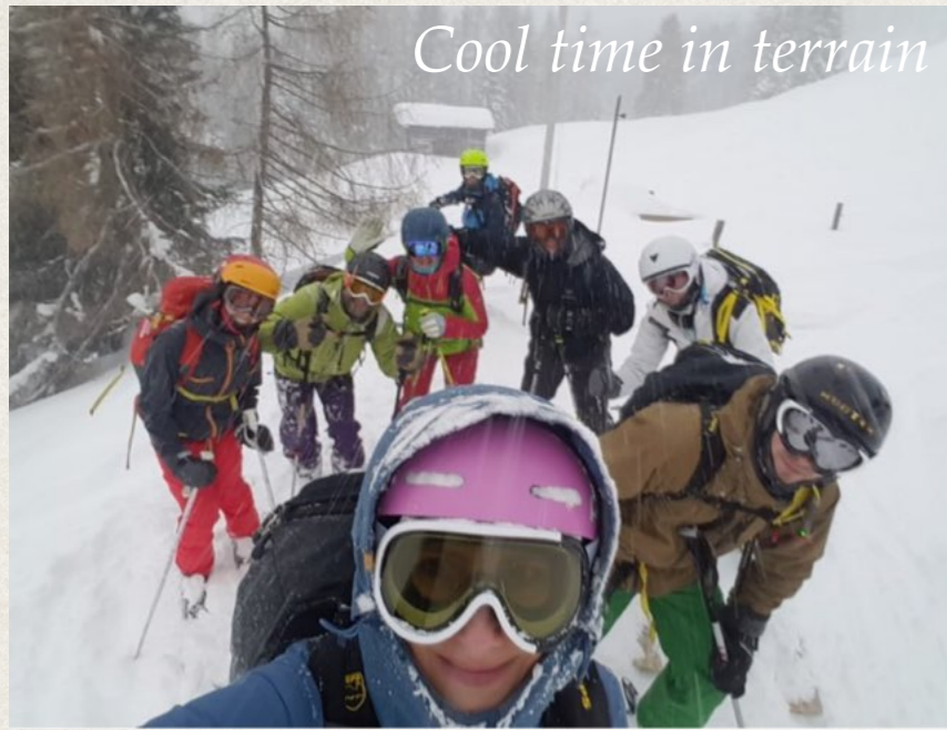
Cool time in terrain