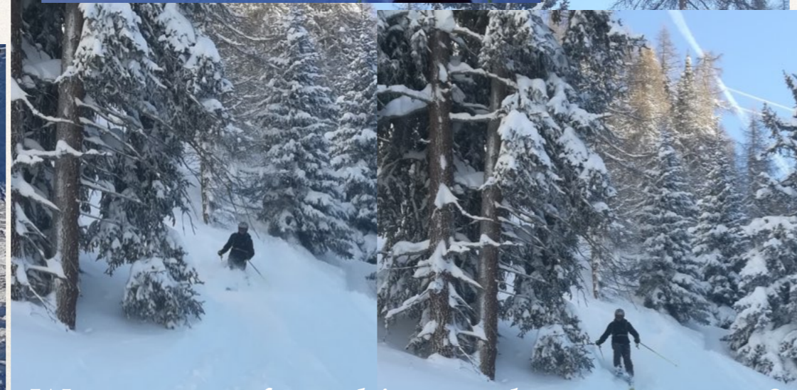
Wanna some free white powder among trees?