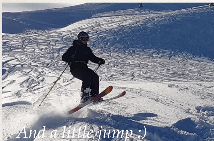
And a little jump :)