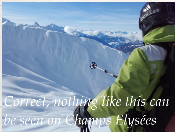
Correct, nothing like this can be seen on Champs Elysées