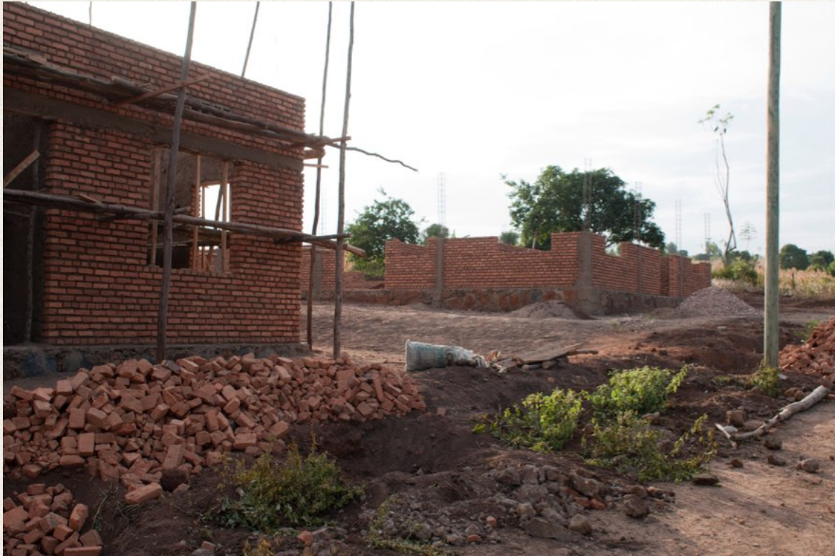
Day Zero for our group (Sunday 22nd Jan)