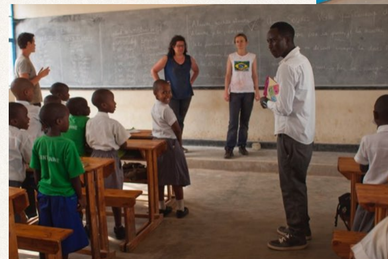
... and school is over!!