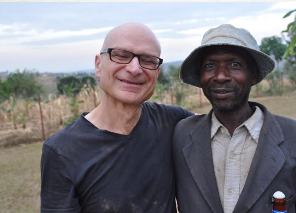
And we ended like a big family