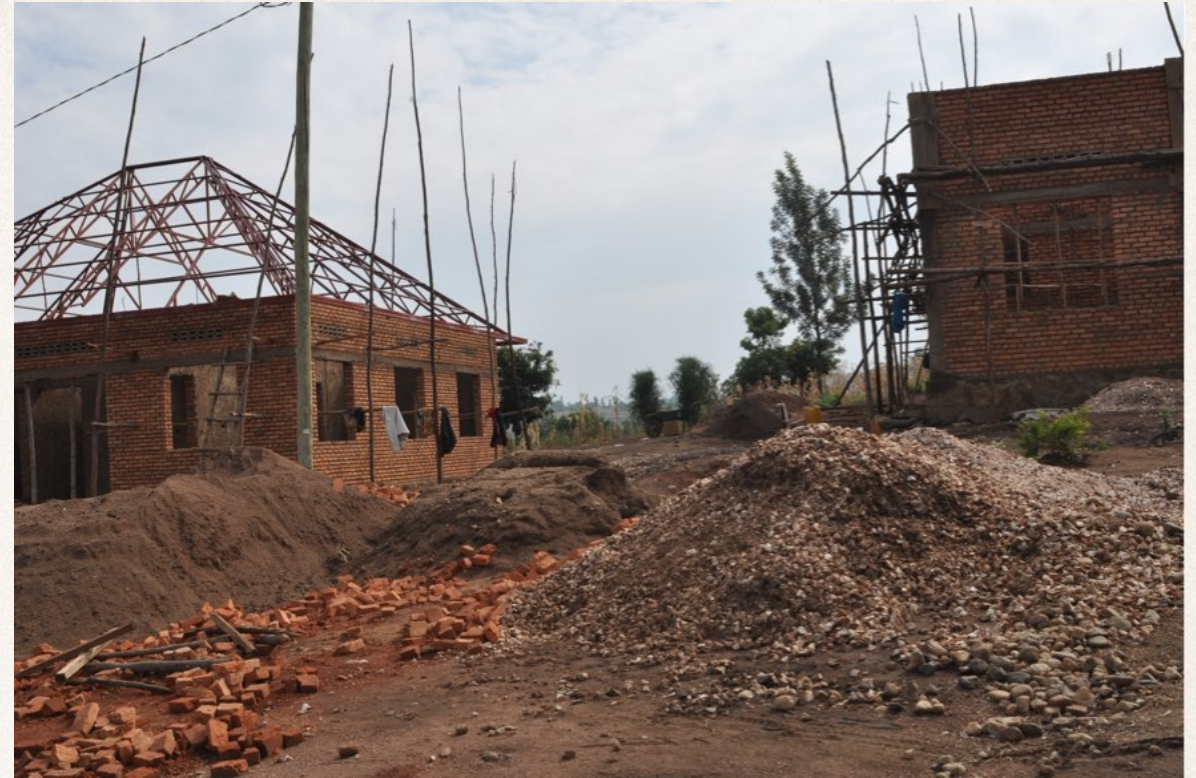
Last day, Friday 3rd Feb