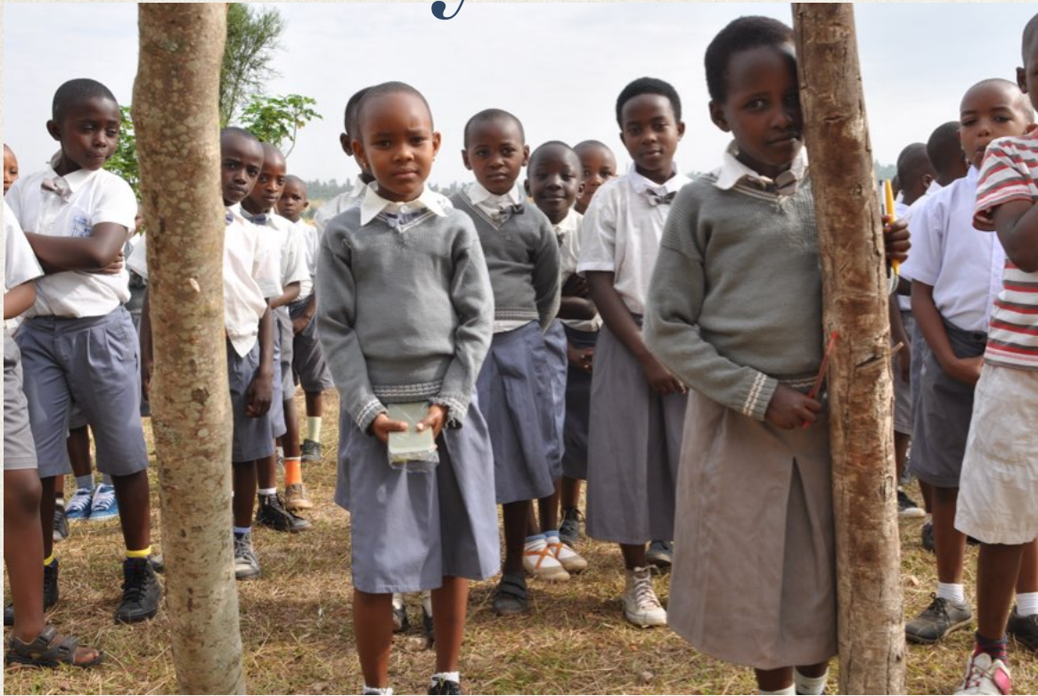
Beginning of school day